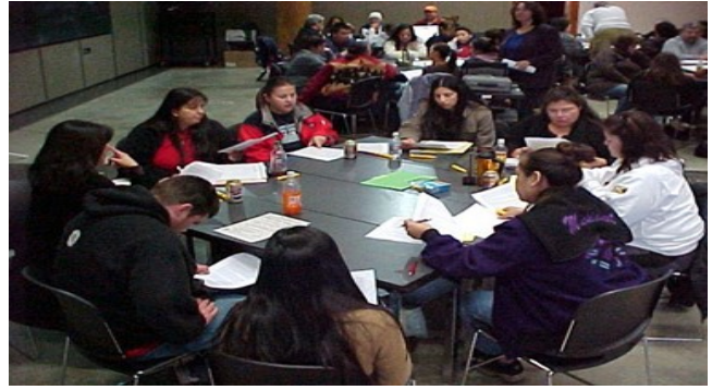
GHC and Evergreen Native Pathways students engage in the use of Native Case studies at one of the weekend gatherings at the Evergreen Longhouse.

While over 30% of the GHC Native Pathways Curriculum has direct cultural relevance in its course content, many core course faculty at GHC have attended the Institute and use Native case studies in their classes supporting even further cultural relevance to the degree.