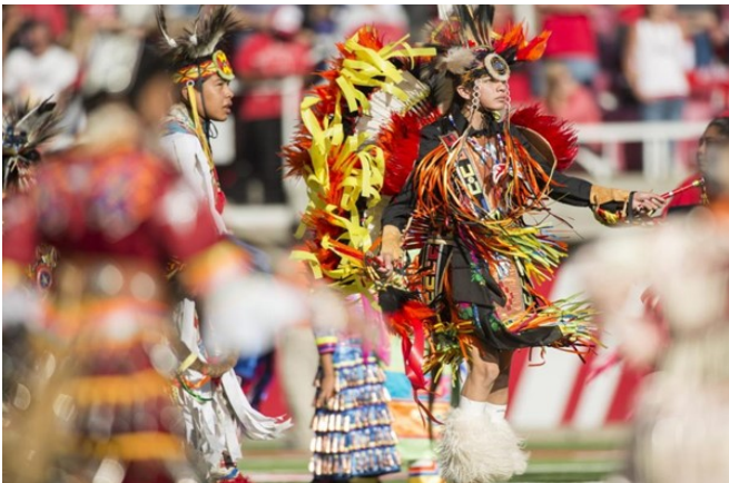
UTE TRIBAL CEREMONIAL DANCERS PERFORM DURING UNIVERSITY OF UTAH FOOTBALL GAME AT LEFT

A memorandum of understanding has been signed by the University of Utah in connection with the use of the Tribal ‘Utes’ name as a sports mascot, but a new stipulated agreement has been signed with the University. The Ute Tribe has agreed to continue allowing sports teams to compete as “Utes” - though as part of an update to the agreement, the school must educate all incoming students about the tribe. (Salt Lake Tribune)