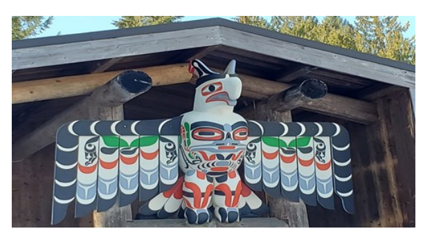
Native Case Studies Supply Cultural Relevance

A unique feature of the Gravs Harbor College Online Native Pathways Degree is that this program supplies cultural relevance to its content in order to make the course of study more meaningful to its place based students. Not only do basic Social Science and Humanities courses address the traditions, history, culture, and ceremony of the Indigenous, but more than half of the instructors currently teaching common courses to the traditional AA degree have attended the Native Cases Institute hosted yearly on the Squaxin Reservation close to Olympia. This institute, (held this year on Nov 3&4), provides professional development in the use of Native Case Studies located on the Evergreen State website. (http://nativecases.evergreen.edu) Over 125 case studies addressing issues in Indian Country on this site are compatible across the curriculum, and GHC instructors who have attended this training have used these case studies in their common courses not traditionally deemed Indigenous in content. More than fifty educators nation-wide attend the Institute yearly, and have either used these cases in the classroom and/or have themselves contributed to the collection through their research.