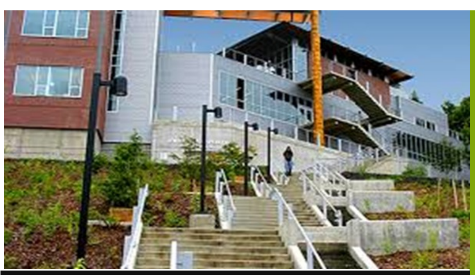
GRAYS HARBOR COLLEGE- WINTER QUARTER BEGINS AT GHC!