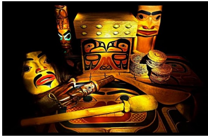
Tsimshian Art Work - Metlakatla, Alaska