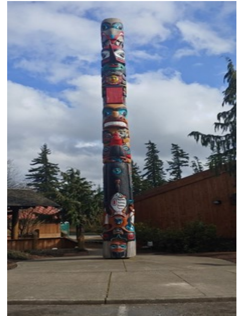
LITTLE CREEK CASINO TOTEM

Emergency declarations and regulations, guidelines and procedures for staying safe, recognition of symptoms, clinical approaches to testing, new pharmacy pick up methods, business closure notifications, health clinic updates, and information concerning resources for management of anxiety issues as well as wellness strategies are all posted on most all tribal websites.